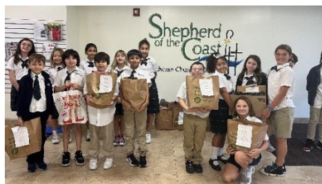
Our students with food collection project